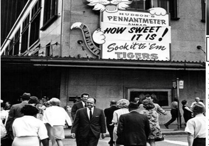
A sign on Hudson's in Detroit hangs in support of the Detroit Tigers during the 1968 World Series.

Hudson's will always be remembered for owning the world's largest flag, which was draped across the building's Woodward façade on Armistice day and other patriotic holidays. The flag was first hung on Armistice day in 1923 and was later shown off at the world's fair in 1939. At 3,700 square feet, the stars were a half-foot tall, and one mile of rope was needed to hang it. The original flag was last displayed in 1949, to be replaced a year later with a new seven story flag that required 55 men to hang it. After being hung for the final time in 1976, the flag was donated to the Smithsonian Institution.